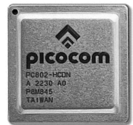
Picocom PC802 5G Small Cell PHY SoC